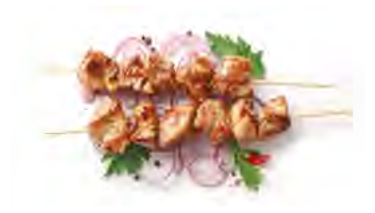
All Prices are Inclusive of VAT, Service Charge and Government Catering Levy

Double pair of freshly prepared Samosas (04 Pcs) Ksh. 1,200 Spring Rolls Ksh. 800 Chicken Wings (08 Pcs) Ksh. 1,200 Tender Beef pair of Mshikaki Ksh. 1,200