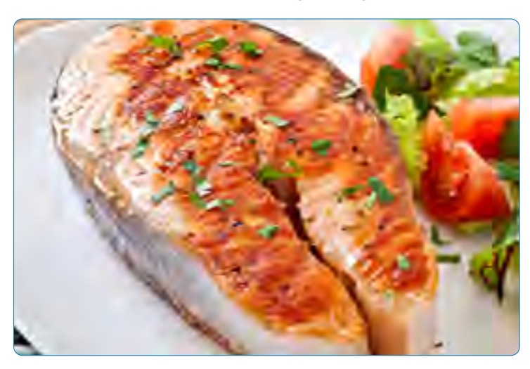
All Prices are Inclusive of VAT, Service Charge and Government Catering Levy

* Sauces: served with either butter sauce, mushroom sauce, white wine sauce, rosemary and thyme sause